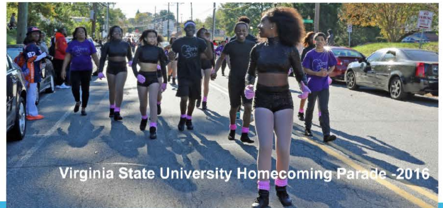
Virginia State University Homecoming Parade -2016