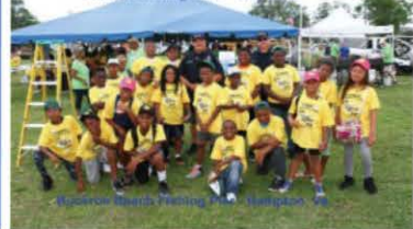
Kiwanis fishing clinic - July 2016

WEEKLY FIELD TRIPS All youth enrolled in the summer jam program can sign-up for field trips as listed below during the program. Trips can be educational or recreational as, roller & ice skating, Kings Dominion, Va. Beach, Busch Gardens, Ocean Breeze, movies & Washington, D.C. Smithsonian Museums.