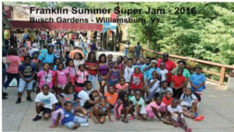
Franklin Summer Super Jam - 2016 Busch Gardens - Williamsburg, Va.

Pool Schedule Pool opening date—19 June Weekend Hours Saturday & Sunday - 1:00 P.M. - 5:00 P.M. Week Day Hours—Monday - Friday • Recreational swim 1:00 P.M. - 5:00 P.M. Pool fees - Ages 0 - 5, $ .75 , Season pass, $25 Ages 6 - 17, $1.00, season pass, $35 Ages 18 & older, $1.25, season pass, $45