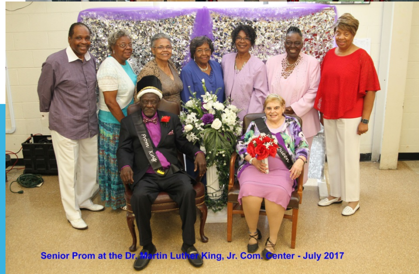
Senior Prom at the Dr. Martin Luther King, Jr. Com. Center - July 2017