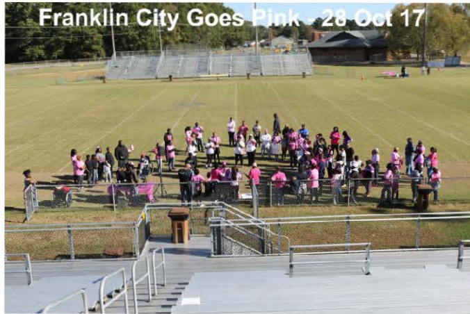
Franklin City Goes Pink - 28 Oct 17