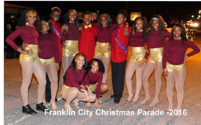
Franklin City Christmas Parade -2016